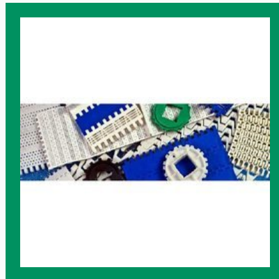
Conveyor System Accessories