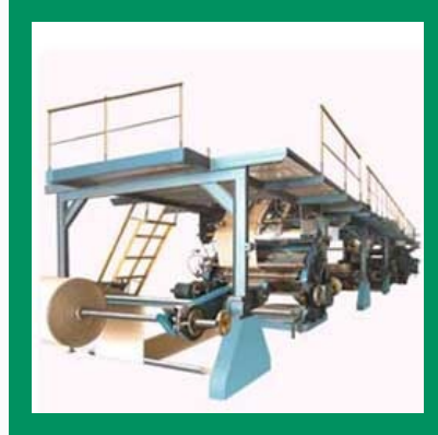
Paper Corrugated Board Making Plant