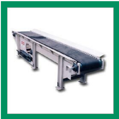
Belt Conveyor Systems