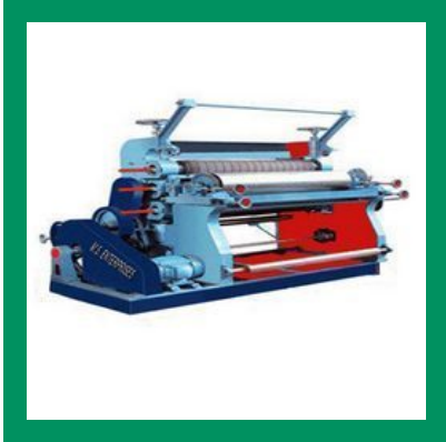
Paper Corrugation Machine