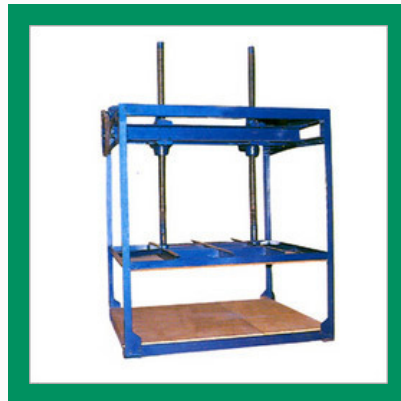
Sheet Pressing Machines