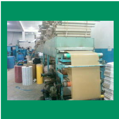
BOPP Tape Plant