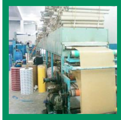
BOPP Self Adhesive Tape Plant