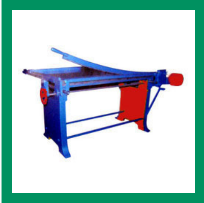
Board Cutter Machine