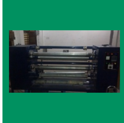
BOPP Tape Slitting Machine