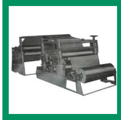
Bitumen Lamination Machine