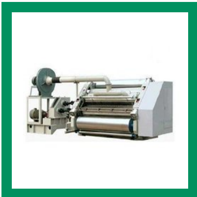
Fingerless Paper Corrugation Machines