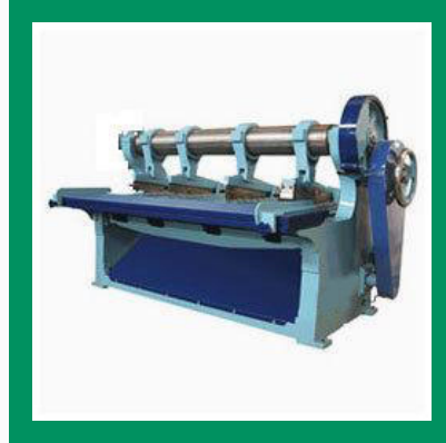
Eccentric Slotter Machine