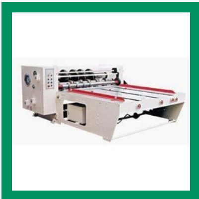
Paper Slotting, Slitting And Creasing Machine