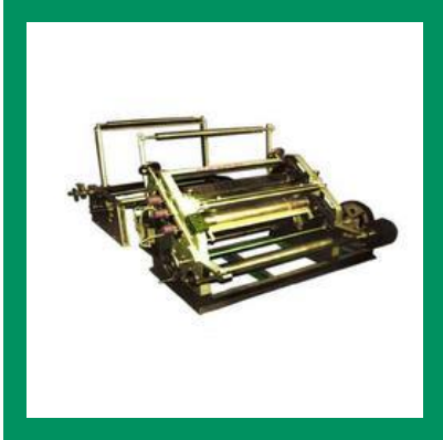
Corrugated Box Machines