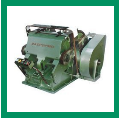
Heavy Duty Die Punching Machine