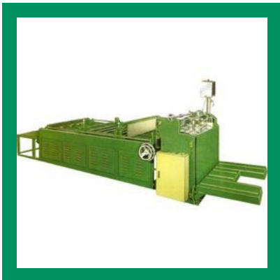
Semi Automatic Gluing Machines