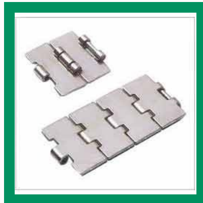
Thermoplastic Slat Chains