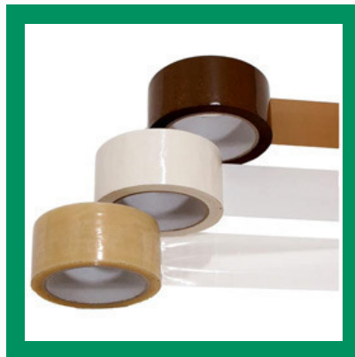
Industrial Packaging Tape