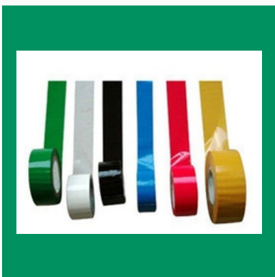
Multi Color Adhesive Tape