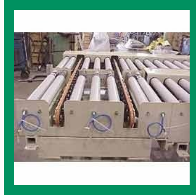
Roller Conveyor Systems