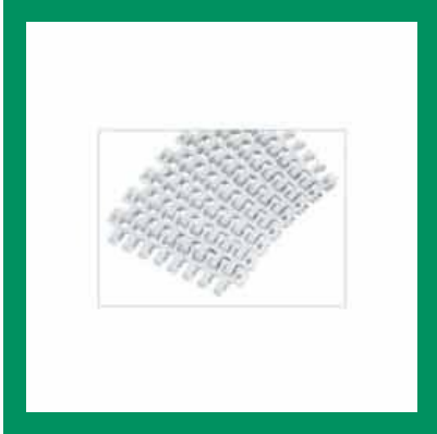
Plastic Modular Belts