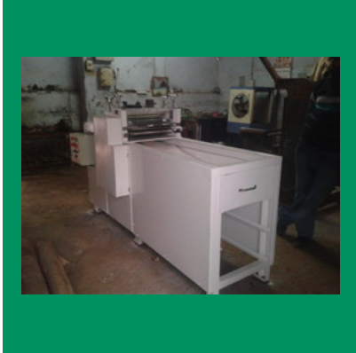
Paper Strip Cutting Machine