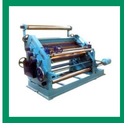
Oblique Corrugated Box Machines