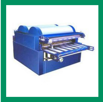
Flexo Printing Machines