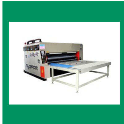
Combiner Printer, Slotter & Die Cutting Machine