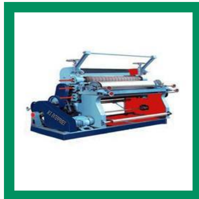
Paper Corrugation Machines (Vertical)