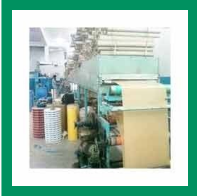
Cello Tape Machine Plant