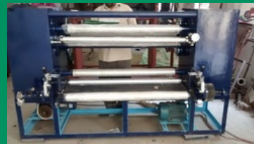
BOPP Tape Slitting Machine