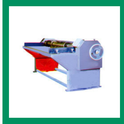
4 Bar Rotary Creasing Cutting Machine