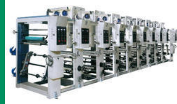
Rotogravure Printing Press