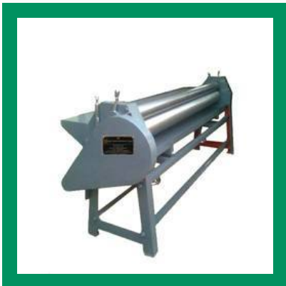
Sheet Pasting Machines