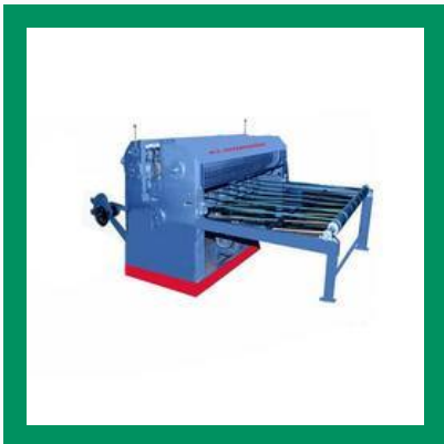
Sheet Cutter Machines