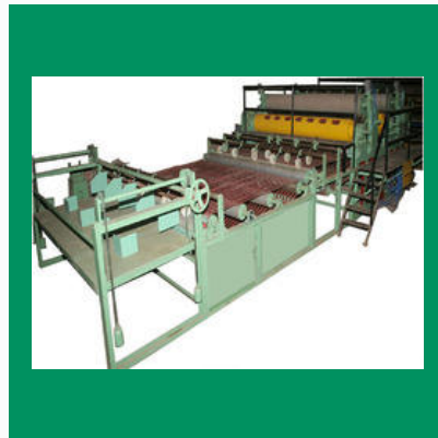
Heavy Duty Duplex Sheet Cutters