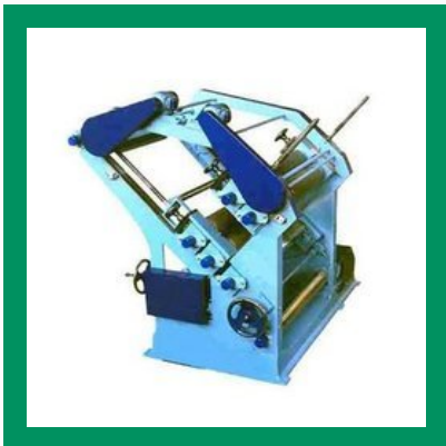
Double Profile Paper Corrugation Machines